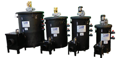
Drum Scrubber (DS)