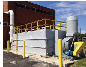
V-Bank Transition System (VTS)