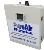
Electronic Bed Monitor (EBM)

PureAir Filtration assists customers in meeting environmental and performance specifications. Our laboratory and various tools help clients track air quality and lifespan of media.